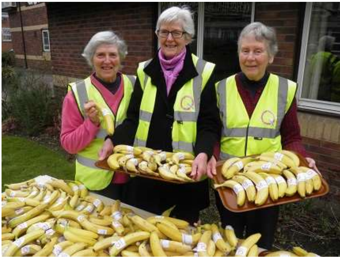
Supporting Fairtrade Fortnight at Carlton Hill in 2013

In a Meeting for Worship towards the end of 2013 we were reminded of the importance of praying for one another and holding one another in the Light, and were reminded to be willing to ask for this help from others. We ask our Friends in Leeds Area Meeting for prayerful support for our life and witness in 2014, as we shall uphold you all in the months ahead.