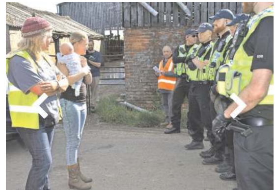
Fracking in Ryedale