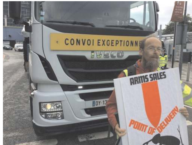
The Arms Fair in London

Bedford Court First and third Wednesdays,