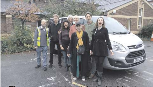
The cast spent the night in the Meeting House before making their way to the next venue

Longing, Belonging and Balfour, the musical, was staged at Carlton Hill on 24th September. It was attended by more than 50 people