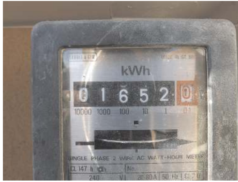
An auspicious meter reading!