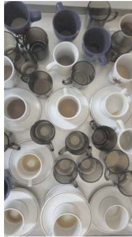
The mammoth cleanup after the show